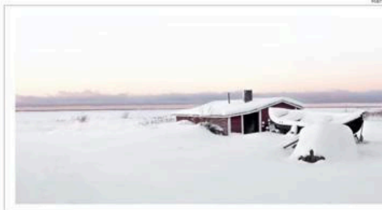
Winter landscape from the west coast.